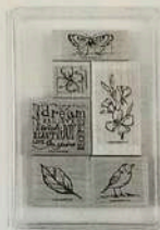
104765 Natural Beauty (set of 5)